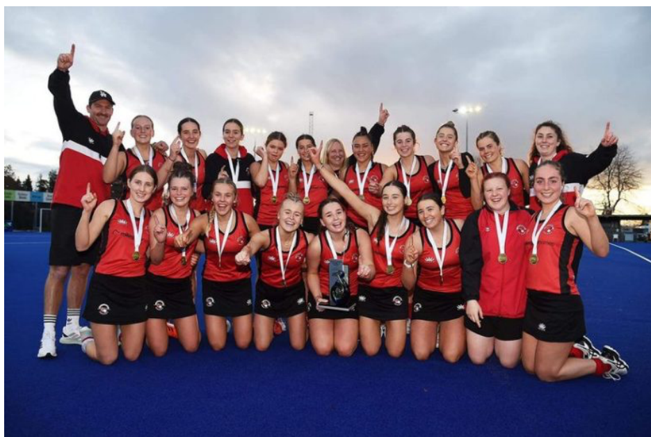
Canterbury 'A' 2022 Amanda Hooper Memorial Trophy Winners – Vantage National U18 Women's Tournament in Nelson